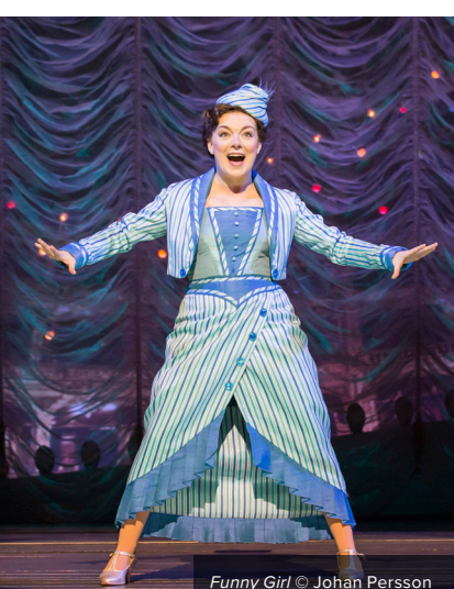
Funny Girl