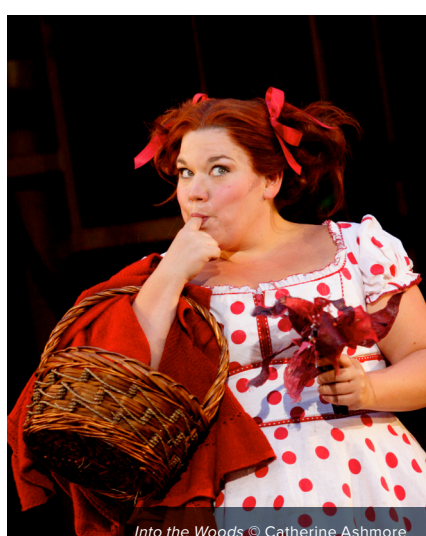
Into the Woods