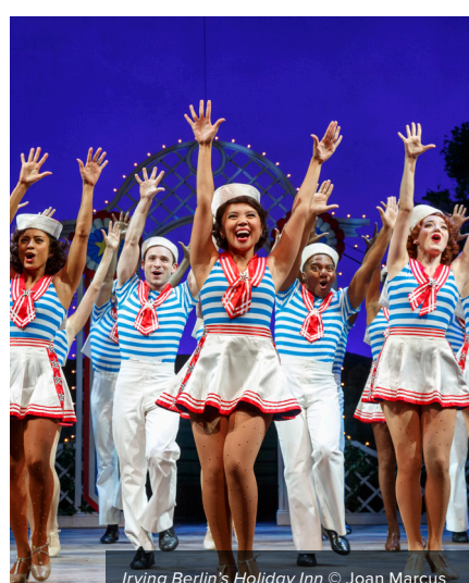
Irving Berlin's Holiday Inn